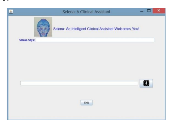
Figure 2: Front End of Selena: A Clinical Assistant

To achieve excellent user experience, user interface must be kept as user friendly as possible and Java Frames provides whatever a normal user wants from any application. A microphone button performs dual tasks, accepting a text input typed into question box or voice input from the device microphone. Following figure shows the typical user interface for Selena: A Clinical Assistant.